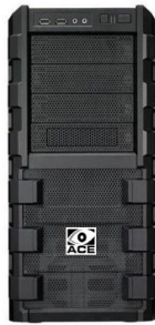
High Air Flow Chassis = Lower Active Cooling Elements