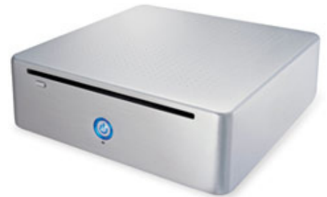
World's Smallest Full-Function PC

The Ace® Vision Mini brings the power of modern Intel® platforms to one of the world's smallest full-featured PC's. Housed in an attractive brushed aluminum chassis measuring only 6.5" square by 1.97" high and 2.8 pounds. The Ace® Vision™ Mini is extremely expandable through the use of Dual USB and Firewire ports. This extremely compact but fully-featured form factor is the perfect computer package for military, security, educational and healthcare applications.