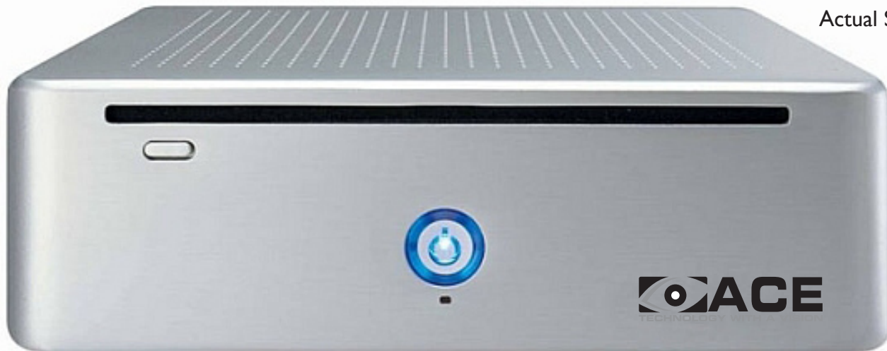
Actual Size !!!

The Ace® Vision™ Mini is fully tested with major Microsoft operating systems so compatibility is guaranteed. The unit is designed and built by Ace Computers, an Intel Premier Solutions Provider, a 3COM Networking partner and Microsoft Certified Solutions Provider, with 23 years of experience providing advanced systems and a stable financial history. Ace Computers is the winner of a 2005 "Best Overall Business" award by NASBA for our expertise and attention to customer care. Ace Computers has been recognized as one of the "Top 100" system builders in the US by CRN Magazine and is a VARBusiness top 500 VAR and plans to continue its dedication to excellence in products and service.