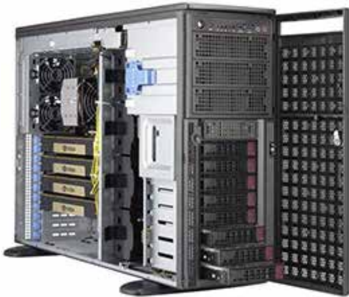
(Top View – System)

2 Redundant 2200W Titanium Level Power Supplies