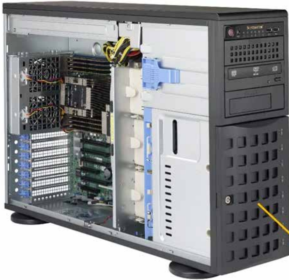
8x 3.5" Hot-swap SATA3 Drive Bays