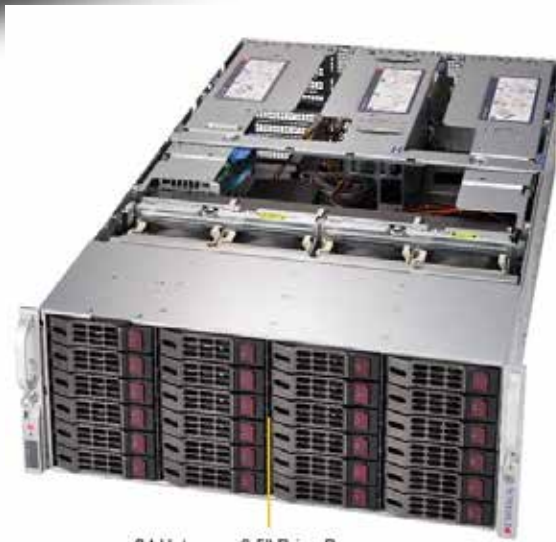
24 Hot-swap 3.5" Drive Bays (8 Hybrid ports with NVMe support via extra AOC)